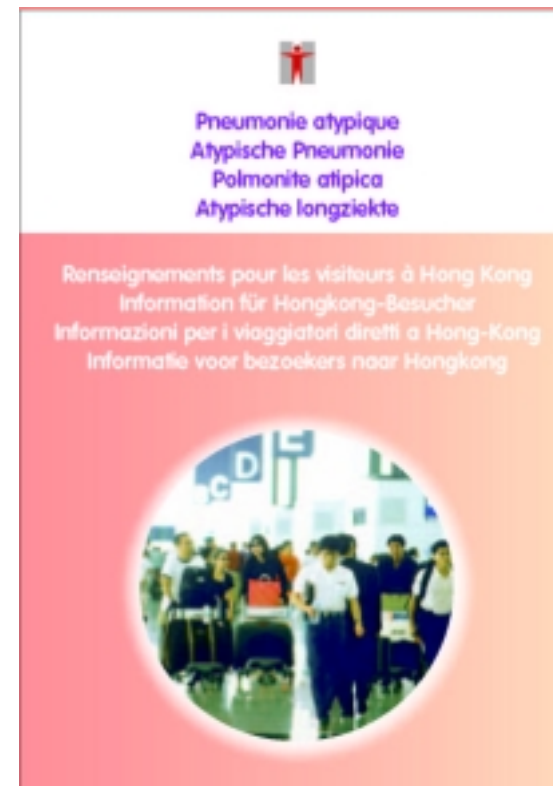
Multi-Langual Version for Foreigners