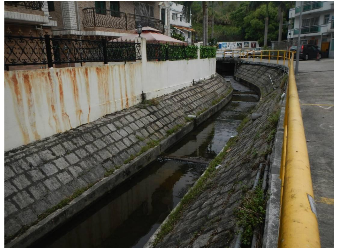
Streams passing through village areas would usually be channelised by DSD or HAD in order to reduce flooding risk