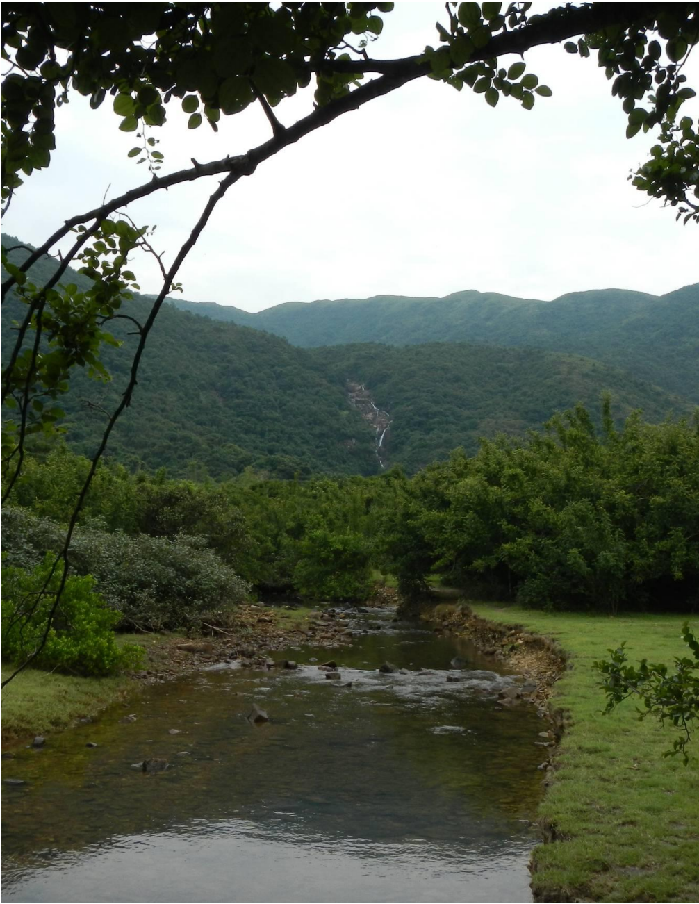
A Country Park Enclave