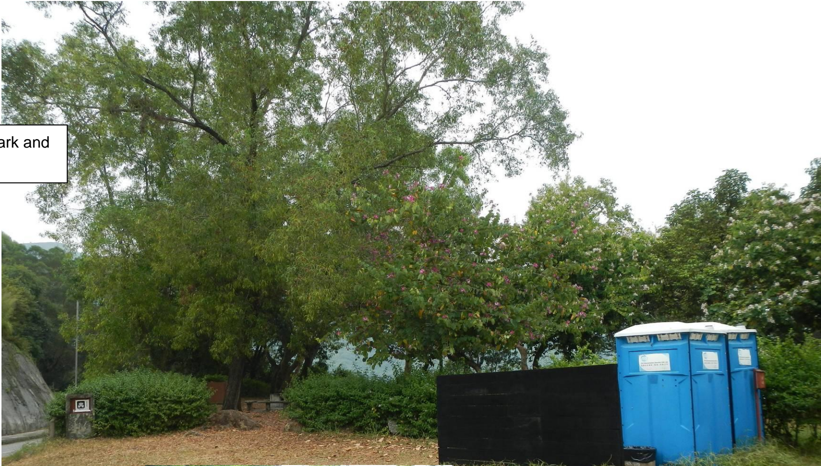
Toilets within Country Park and the surrounding areas