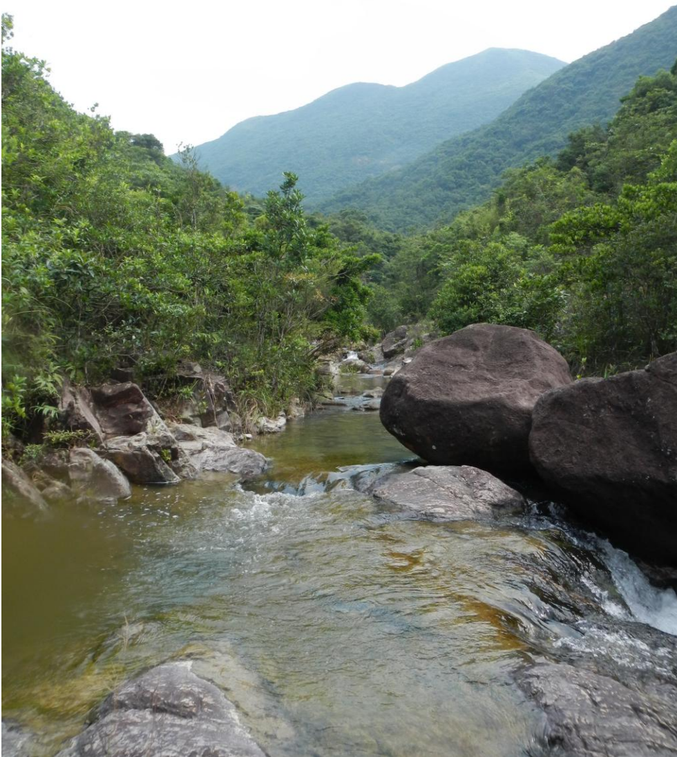
Natural stream within Country Park