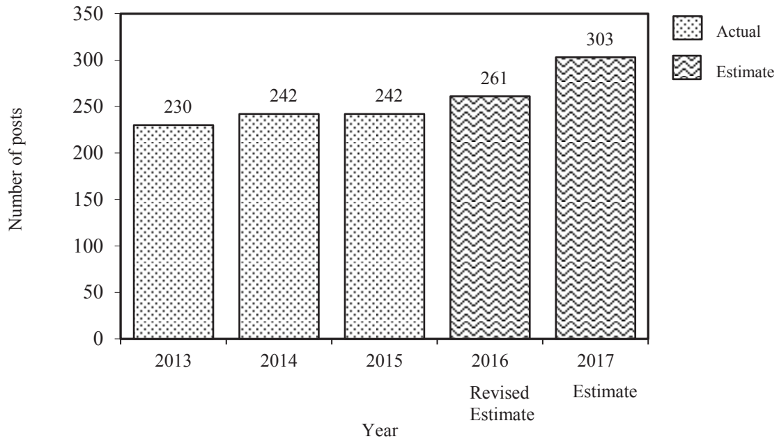
Changes in the size of the establishment (as at 31 March)