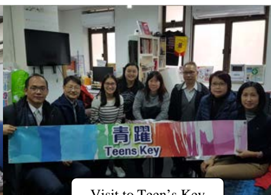
Visit to Teen's Key