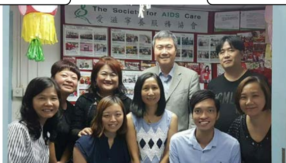
Visit to The Society for AIDS care Limited