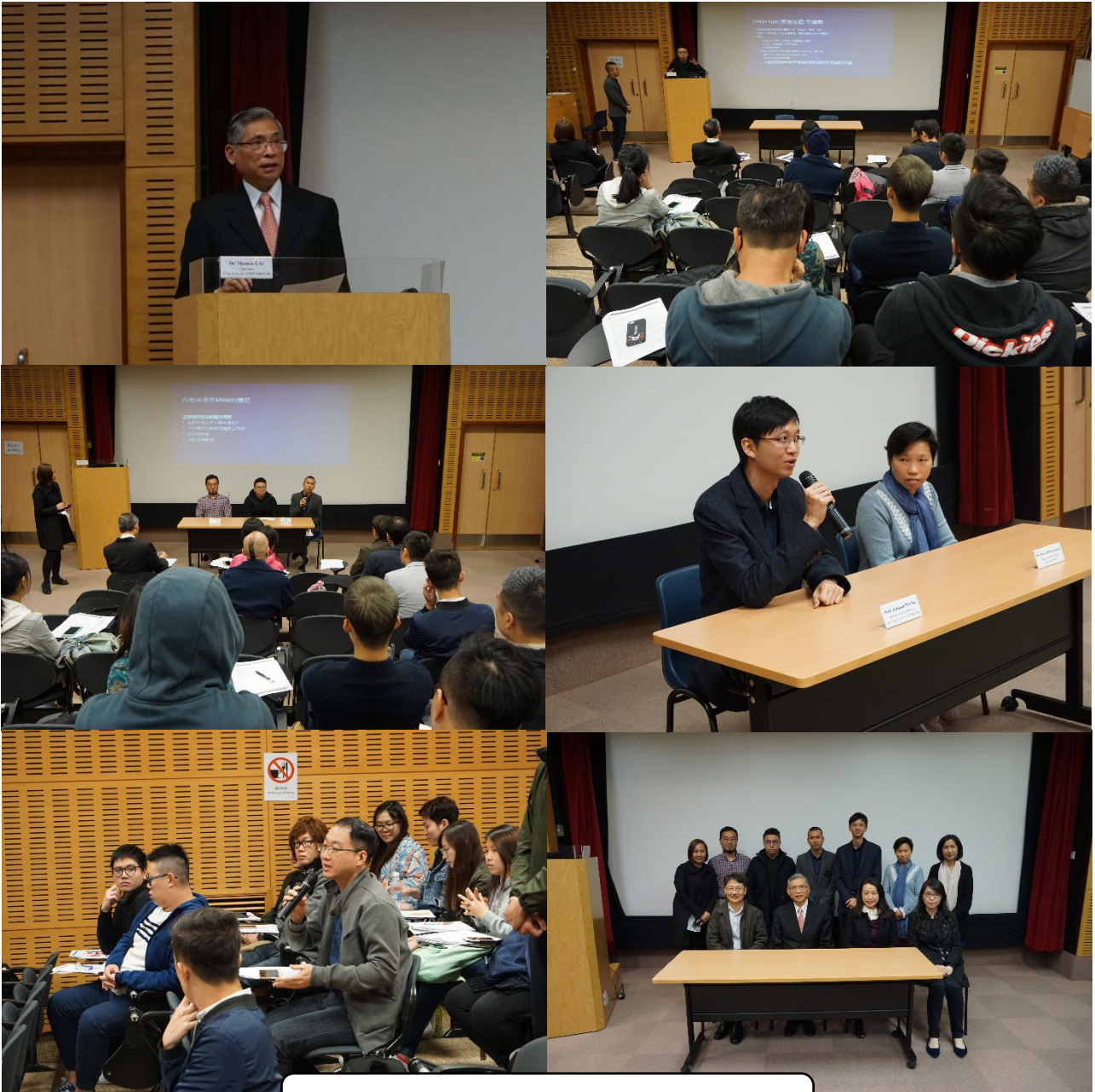
ATF Sharing Session on 5 December 2017

A sharing session was held on 5 December 2017. The session served as a platform for grantees to share their experience on HIV prevention and control in priority communities, as well as AIDS-related research through their programmes supported by the Fund.